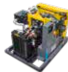
Boosters and speciality air